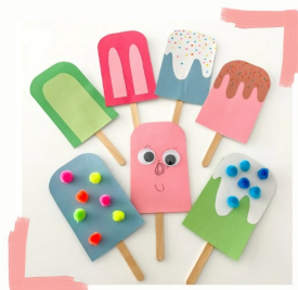
Paper popsicles July Craft Kit

Tuesday: 9:30am to 4:30pm Wednesday: 9:30am to 4:30pm & 6:00 to 8:00pm Thursday: 9:30am to 4:30pm & 6:00 to 8:00pm Friday: 10:00am to 2:00pm